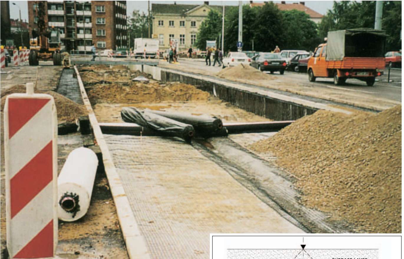
Track renovation - Rostock Street Tramway AG